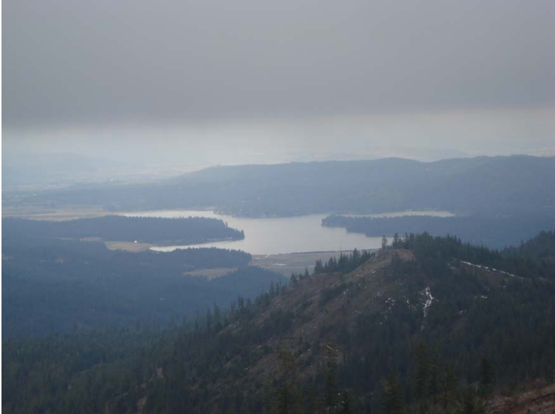
A view of Newman Lake on the way back from Round Top snow course on 4/1/2010.