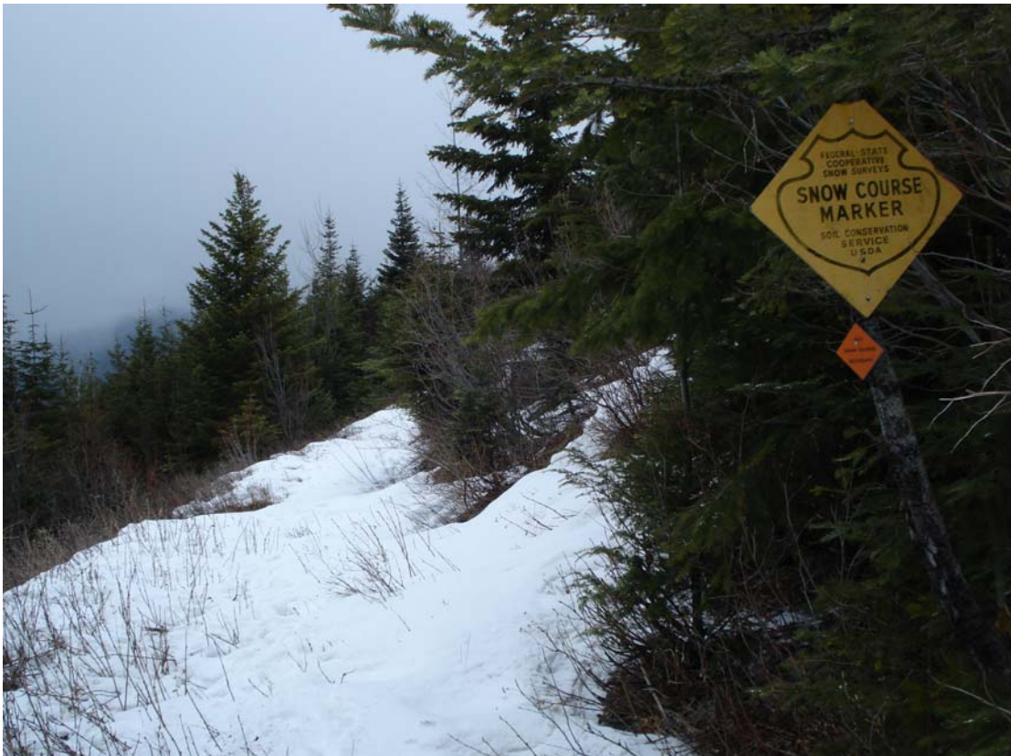
Round Top snow course (elev. 4020') with snow on 4/1/2010.

SWE = Snow Water Equivalent, Precip = Precipitation