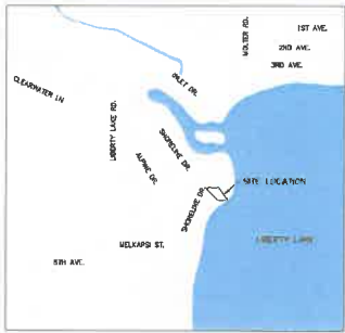
VICINITY MAP 525 S SHORTLINE DR., LIBERTY LAKE, WA 99019 PARCEL NUMBER: 552214135