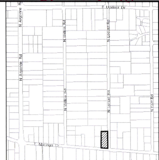
VICINITY MAP 1" = 400'