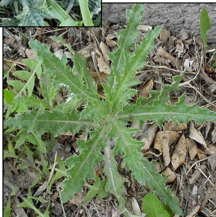
Below: Canada thistle

Bull thistle and Canada thistle are often mistaken for each other at this stage of growth