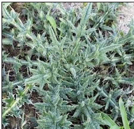
Left: Bull thistle