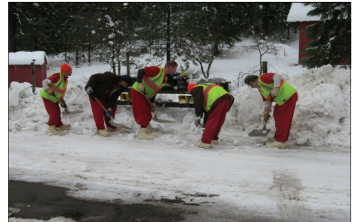
One of the cards received from the community: