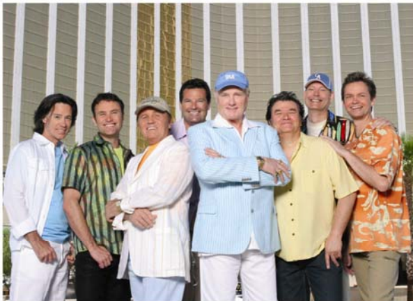
The Beach Boys

POULTRY TIDBIT: According to calculations from Ag Economists at Washington State University, the economic impact of Washington's Fryer industry exceeds $300,000,000. Over 3,500 jobs are affected by the industry, including approximately 1,500 in allied industries-including the retail and wholesale grocery trade, food service, transportation, packaging, etc.